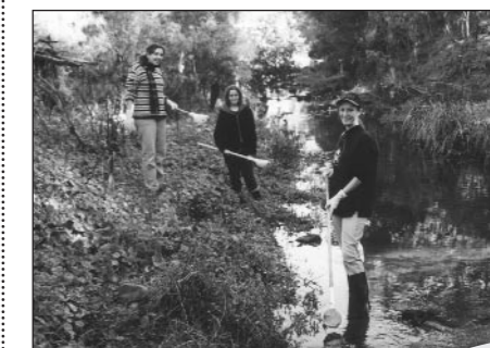
Winston Hills Girls Guides training to use the Streamwatch Kit.

OzGreen conducted three training workshops on use of the kit for local teachers, librarians and council staff in late November. Local schools are expected to start using the kit from early next year. The Trust has committed to keeping the kit up-to-date and doing a major revision every five years.