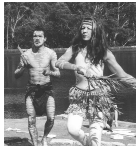
The BundahBunna Miyumba Aboriginal dance group on the edge of Lake Parramatta at the launch of Water Week.

The Trustees and staff would like to wish everyone a safe and very happy Christmas and joyous new year.