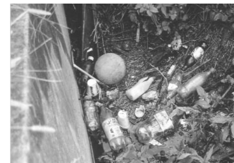
Litter is a big pollution problem in local creek and stormwater drains.

Community Groups: Quarry Branch South Bushcare Group, Winston Hills Girls Guide