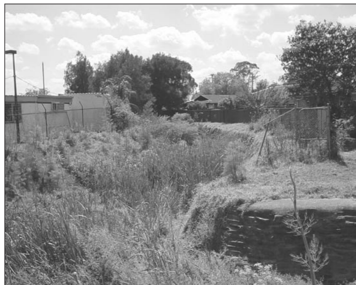
Grantham Creek near Santiago Place at Seven Hills