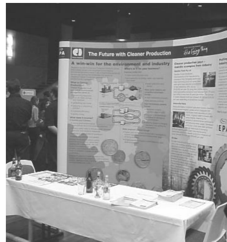
The EPA provided information on tools to help small business to achieve cleaner production at the Trade Show.

The demonstration projects are expected to include: