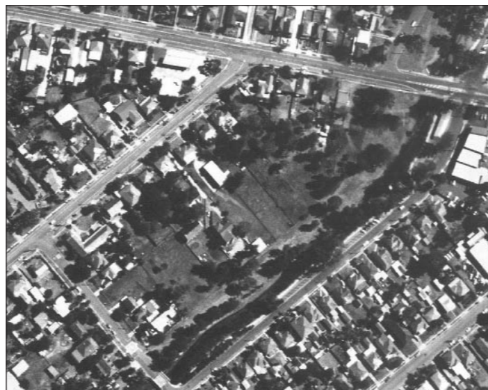
An aerial view of the Metella Road floodway in Toongabbie.